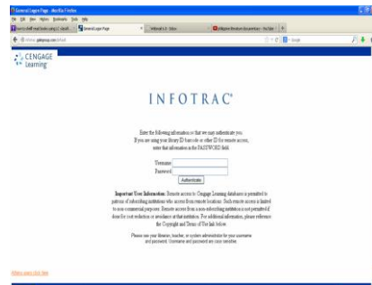
INFOTRAC, a family of full-text databases

library staff as one way of continuing education and update to all as soon as possible.