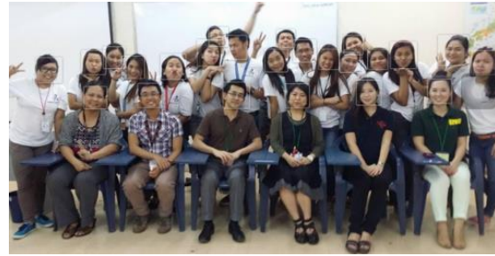
Figure 2 Facebook face detection.

The system will identify how much area a face occupies in an image image, if the area occupied by the face is about 50%. it will be classified as non-nudity and safe. This is to reduce the computing load for the actual nudity detection.