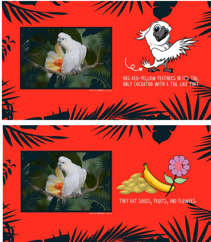
Figure 4. Infographic Video