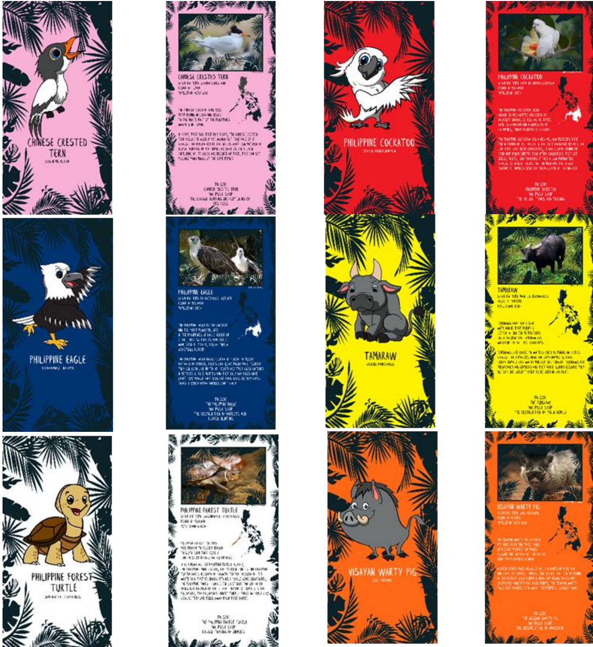
Figure 3. Brochures