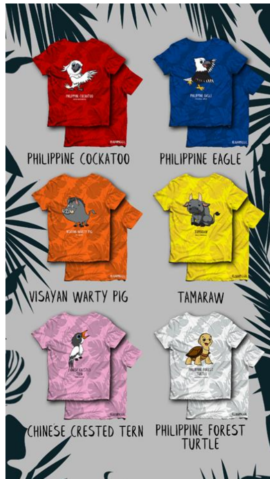
Figure 2. T-shirt designs

Behind the Woods: Endangered animals in the Philippines was shown in the outputs: T-Shirt, Brochure and Infographic video. The said materials provide useful information while showing it to the kids which they find it very informative and very eye-catching.